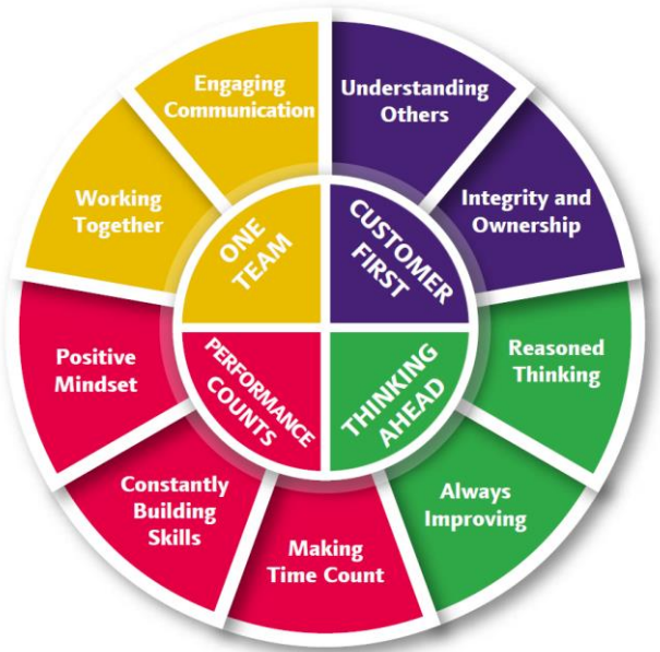
Figure 2: Our Core Values

2.4 Performance management encompasses everything the Council does and it is everyone’s job. This framework applies to all employees. In these times of reducing budgets and increasing demand for Council services, the need for effective performance management has never been greater, as this allows us to: