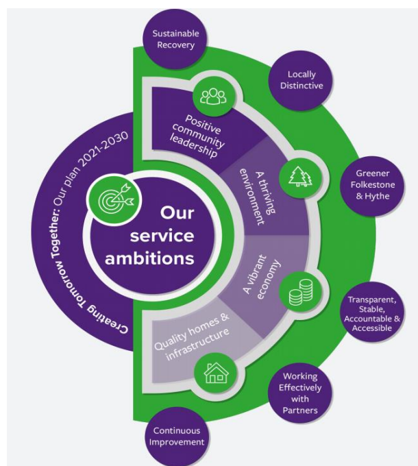
Figure 1: Corporate Plan 2020-31 Vision, Service Ambitions and Guiding Principles